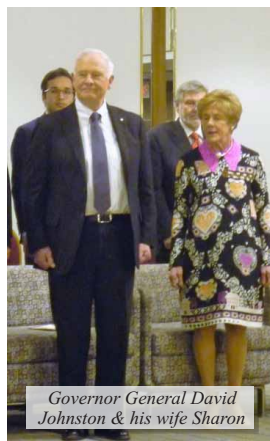
Governor General David Johnston & his wife Sharon

A DVD of the singing was emailed to Buckingham Palace for the Queen's birthday the next day.