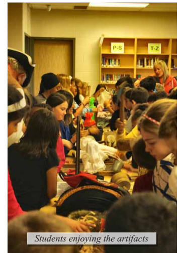
Students enjoying the artifacts